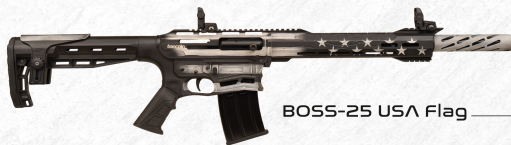
BOSS-25 USA Flag