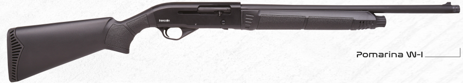
Pomarina W-I _____