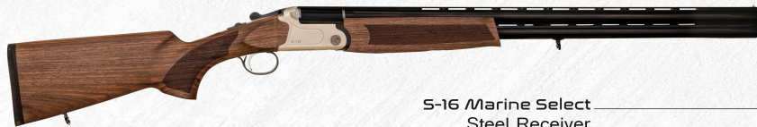
S-16 Marine Select Steel Receiver