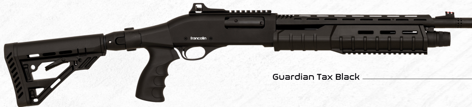
Guardian Tax Black