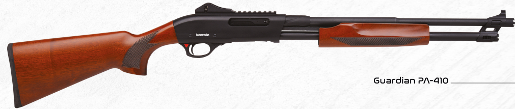
Guardian PA-410 _____