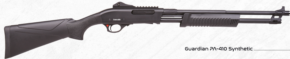
Guardian PA-410 Synthetic _____