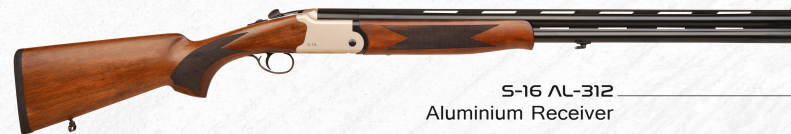
S-16 AL-312 Aluminium Receiver