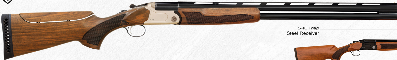
S-16 Trap Steel Receiver