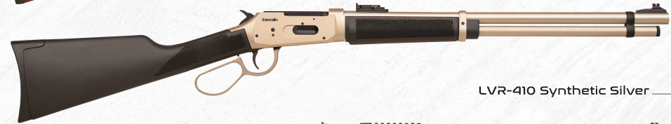
LVR-410 Synthetic Silver