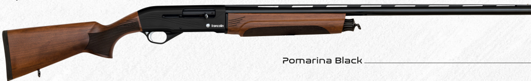
Pomarina Black _____