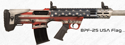
BPF-25 USA Flag