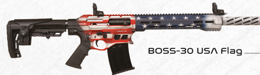
BOSS-30 USA Flag