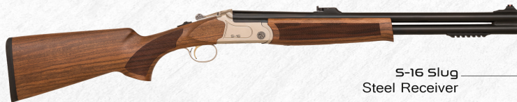
S-16 Slug Steel Receiver