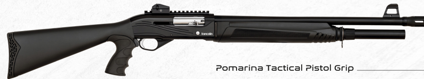
Pomarina Tactical Pistol Grip _____