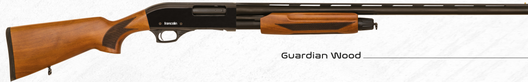
Guardian Wood _____