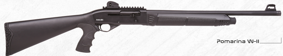
Pomarina W-II _____