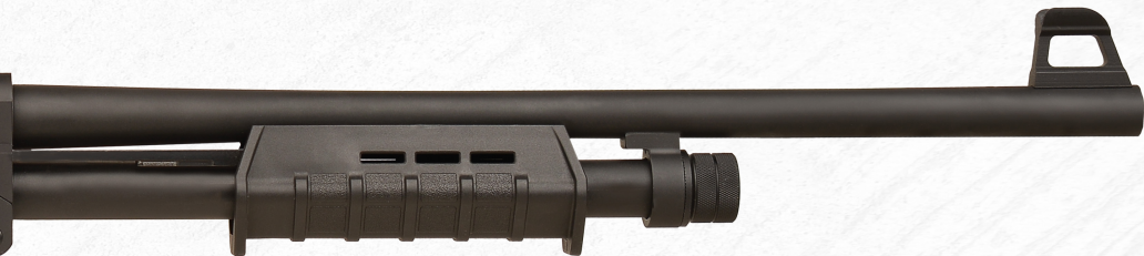
Guardian BRK Synthetic